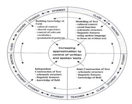
Figure 3. Boeriswati Cycle

Riddet and Boeriswati discussed about this genre approach both originated from Vygotsky's discussion of the Zone of Proximal Development (ZPD) (Riddet, 2015; Boeriswati, 2016). Vygotsky argues that learning is what happens in the 'zone' just above what students can do independently. This is what he calls the 'zone of proximal development' (ZPD) and he defines it as: ... the distance between the actual (learner) level of development as determined by independent problem solving and the level of potential development as determined through problem solving under adult guidance or collaborating with more proficient colleagues (Axford, 2009).