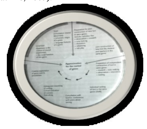
Figure 1. Learning stages

The stages of genre-based learning are described by Watkins and Knapp (Knapp & Watkins, 2005).