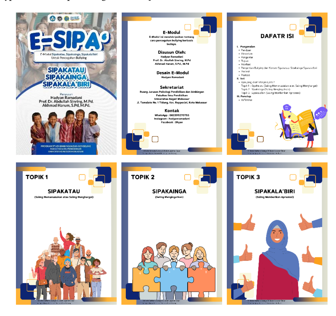
Figure 2. Before the Revision of Material Validation

The concept of E-Module will be developed to make the concept of E-Module in accordance with expectations with the help of Canva and obtain the the in figure 1 & 2, before anda after validation.