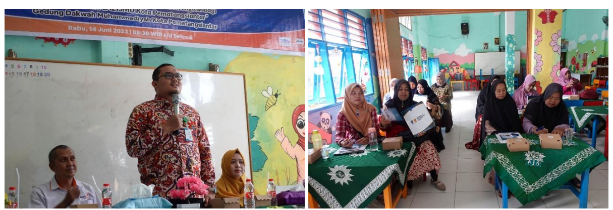
Figure 1. Greetings and Information from the Head of the Implementation Team and Participants Practice the Google My Business Application Directly

After the demonstration session, it was the participants' turn to jump in directly. They can practice what they have just seen on their respective devices. This is the moment where theory meets practice, and knowledge begins to transform into skill.